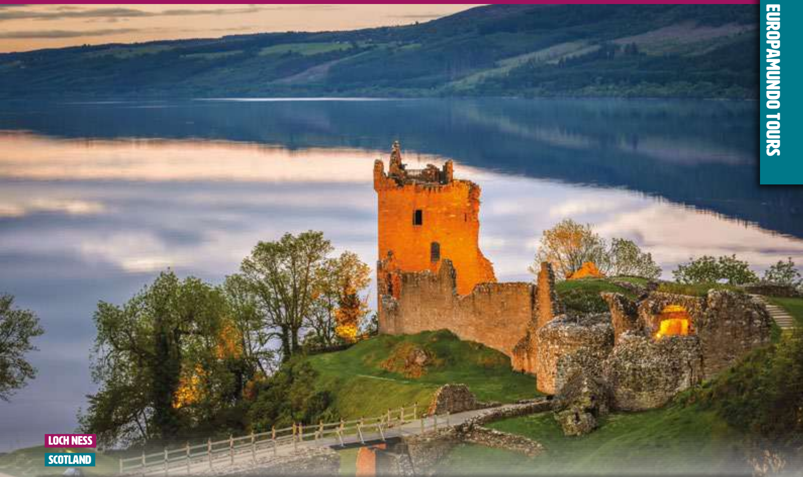
LOCH NESS SCOTLAND

journey takes us towards Northern Ireland , arriving in BELFAST , Northern Ireland's capital city. This monumental city is overcoming its religious conflicts. We will resume our journey to EIRE in Ireland . Last stop will be DUBLIN , arriving at the end of the day.