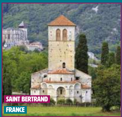
SAINT BERTRAND FRANCE