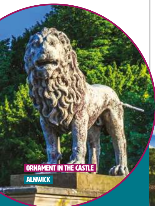
ORNAMENT IN THE CASTLE

See the hotels provided for this trip in the final part of the brochure and on the website's "My Trip" page.