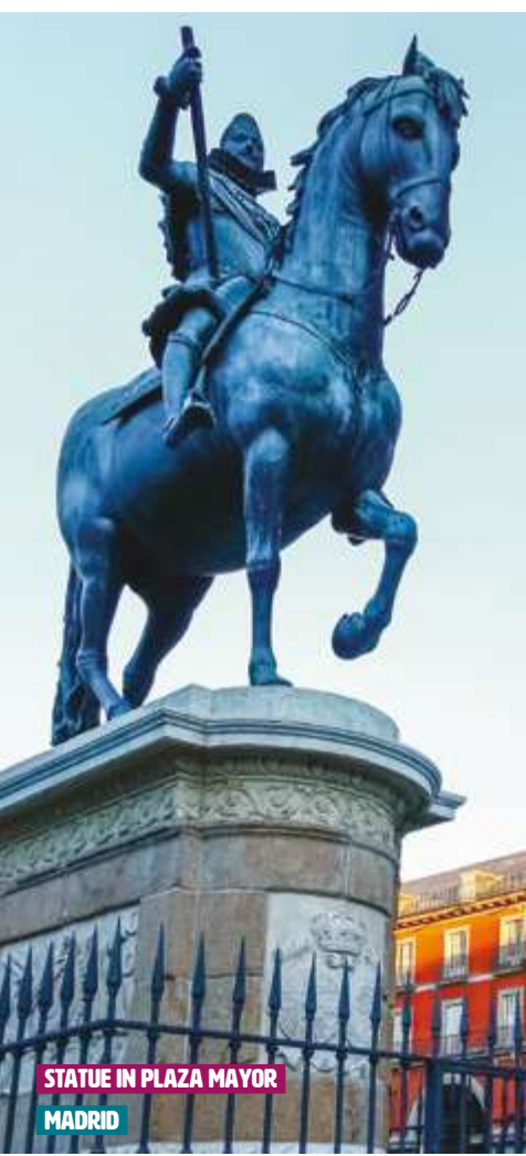
STATUE IN PLAZA MAYOR

See the hotels provided for this trip in the final part of the brochure and on the website's "My Trip" page.