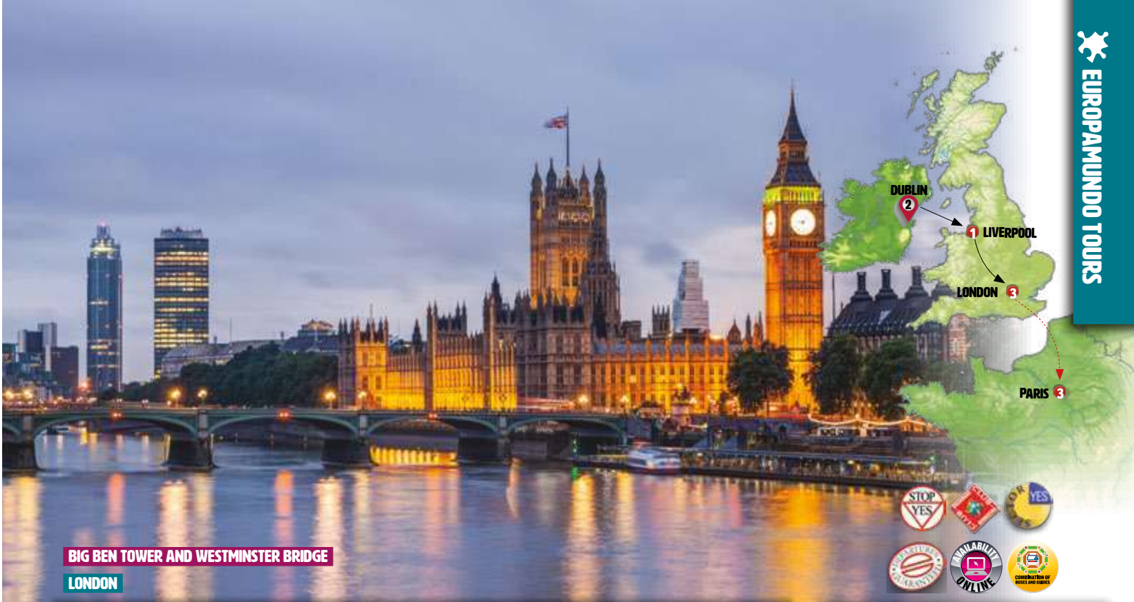
BIG BEN TOWER AND WESTMINSTER BRIDGE