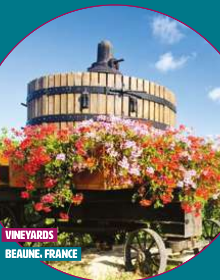
VINEYARDS BEAUNE, FRANCE

End of our services. Please, check the time of your flight in case you might need an additional night.