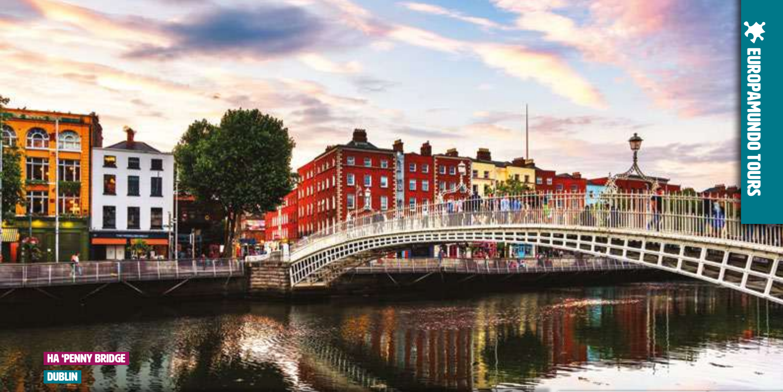
HA 'PENNY BRIDGE