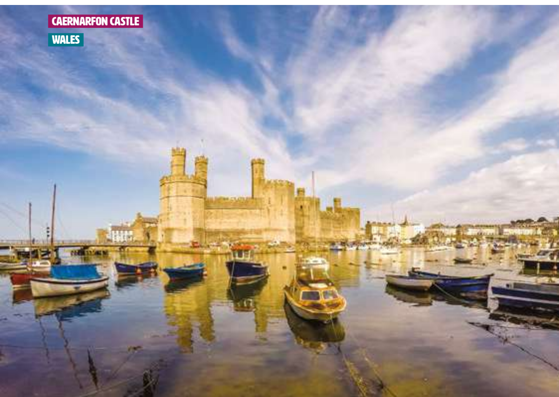
CAERNARFON CASTLE WALES

End of our services. Please, check the time of your flight in case you might need an additional night.