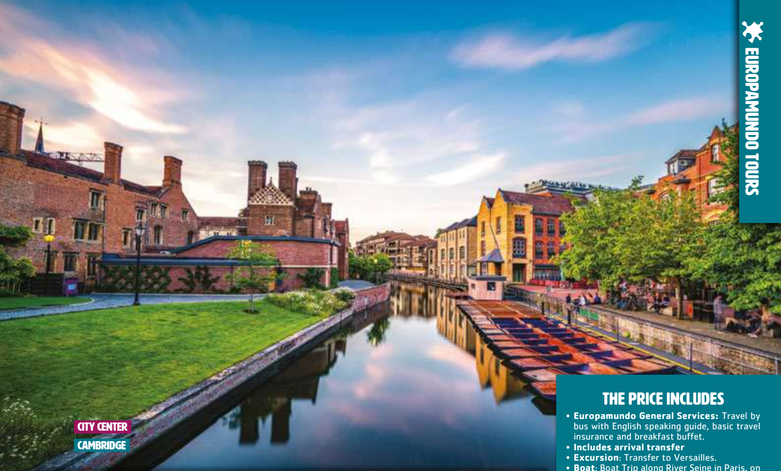
CITY CENTER CAMBRIDGE

charming little village. We will continue and pass by INVERNESS in the north of Scotland, a city located very near the mysterious Loch Ness. After lunch we visit ( entrance included ) the URQUHART medieval castle, from here we will take a boat trip on the dark waters of the lake. Afterwards, we will pass through FORT AUGUST with its sluice gate system and FORT WILLIAM , the tourist center at the foot of Ben Nevis (the highest summit in the United Kingdom). We will return south through the high plateaus where it is possible to glimpse the snow before visiting Loch Lomond, one of the most popular lakes in Scotland. We arrive in GLASGOW at the end of the day. Short stroll around the city center and accommodation.