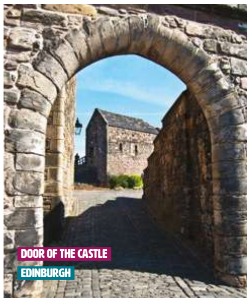
DOOR OF THE CASTLE

End of our services. Please, check the time of your flight in case you might need an additional night.