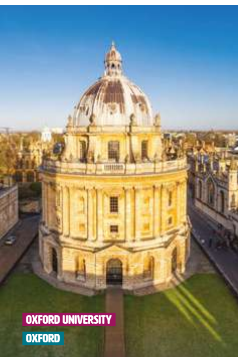
OXFORD UNIVERSITY OXFORD

See the hotels provided for this trip in the final part of the brochure and on the website's "My Trip" page.