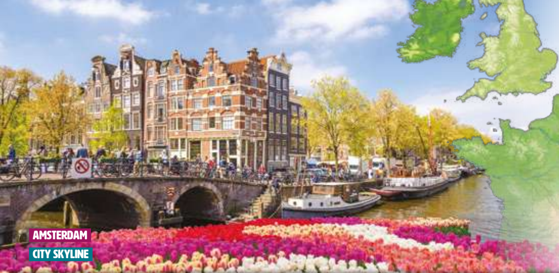
AMSTERDAM CITY SKYLINE