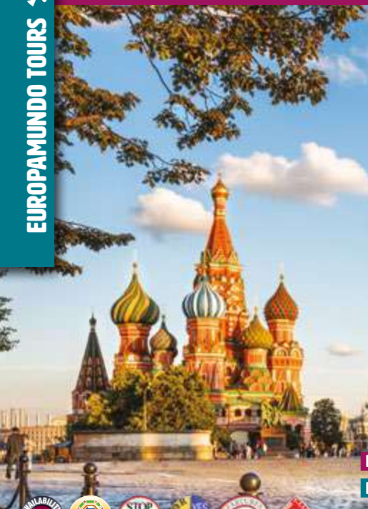
RED SQUARE IN MOSCOW