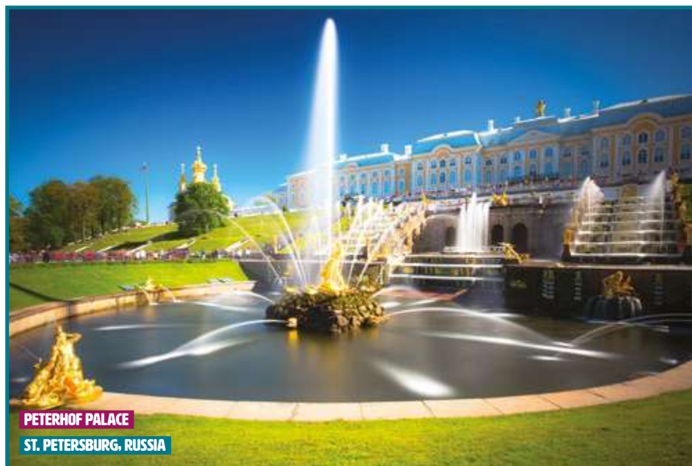
PETERHOF PALACE ST. PETERSBURG, RUSSIA