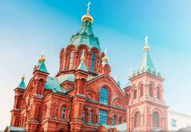
USPENSKI CATHEDRAL. HELSINKI, FINLAND