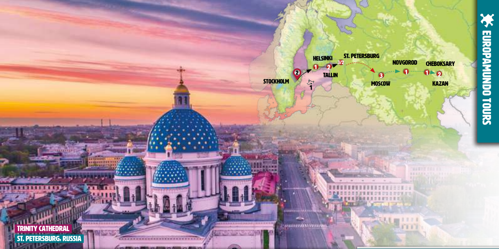
TRINITY CATHEDRAL ST. PETERSBURG, RUSSIA