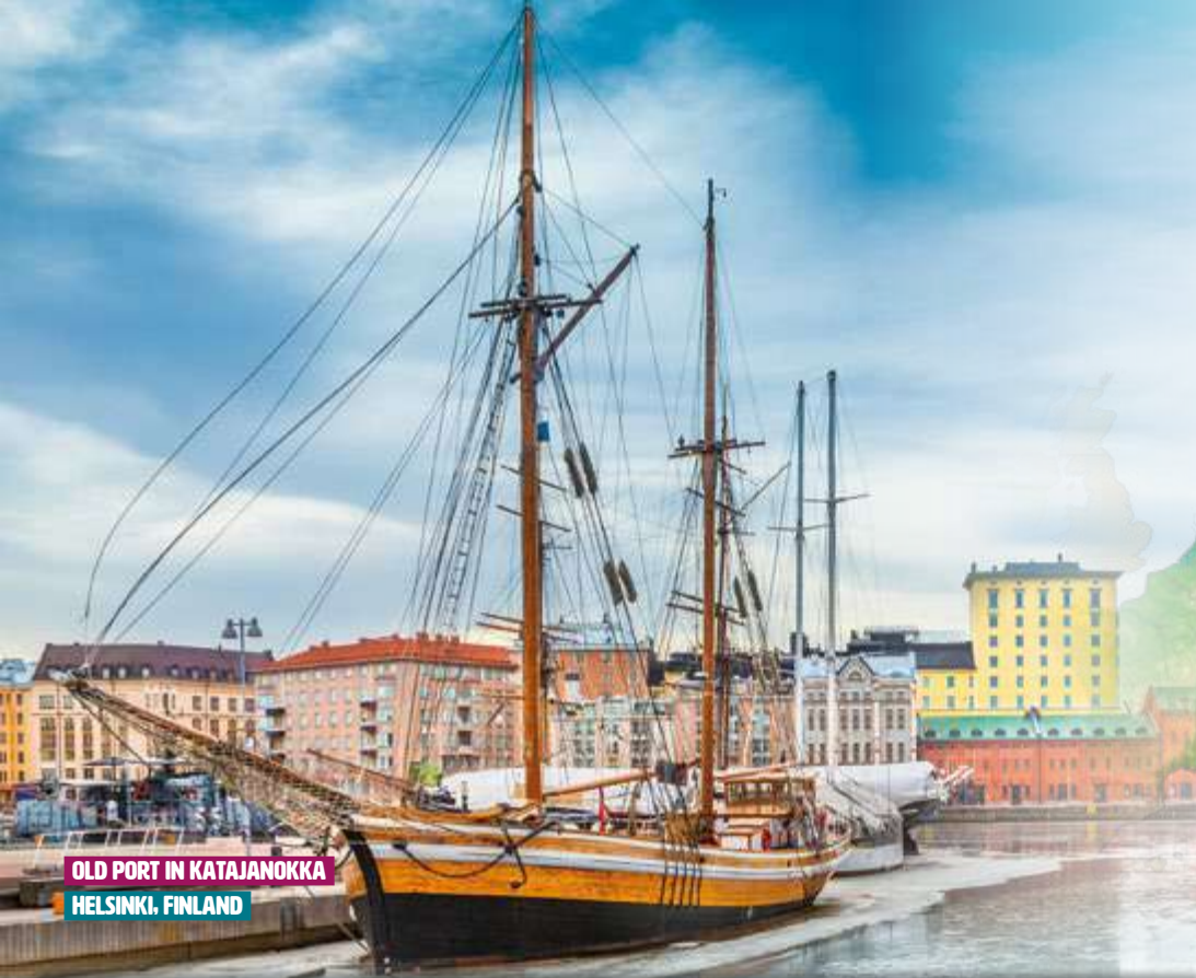
OLD PORT IN KATAJANOKKA HELSINKI, FINLAND