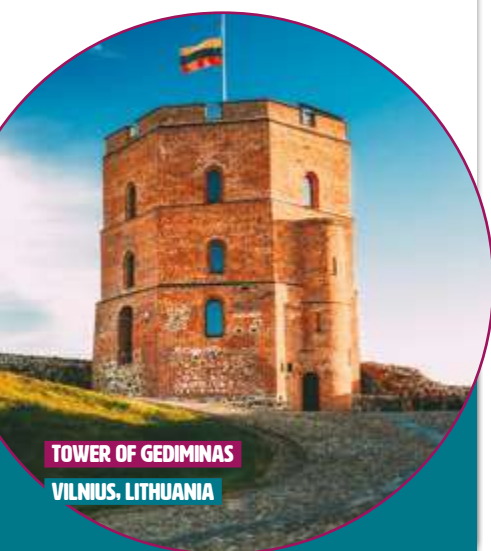
TOWER OF GEDIMINAS

We recommend travelling with a credit card to Scandinavian countries where its increasingly common for businesses not to accept cash payment