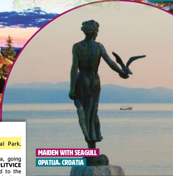
MAIDEN WITH SEAGULL OPATIJA, CROATIA