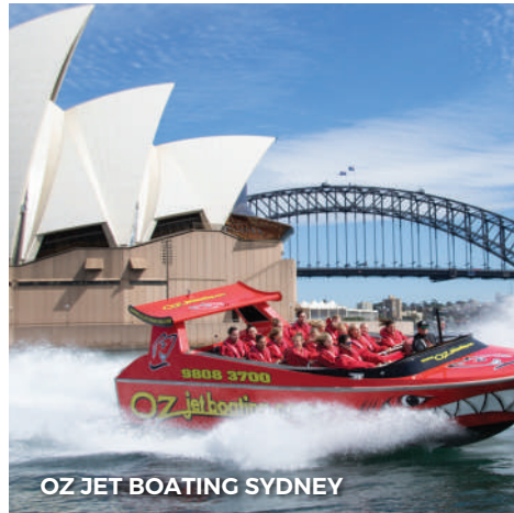
OZ JET BOATING SYDNEY

Note: No need to show your eTicket prior to boarding the train, just go to your pre reserved carriage and seat. The conductor will come through the train when underway.