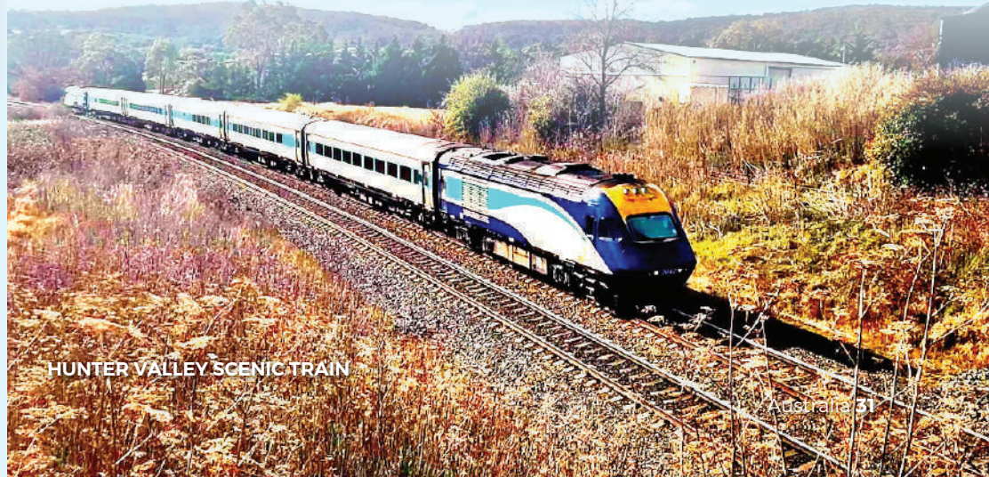
HUNTER VALLEY SCENIC TRAIN

*Note: Hotel subject to final confirmation. Should there be changes, customers will be offered similar accommodation to the list.