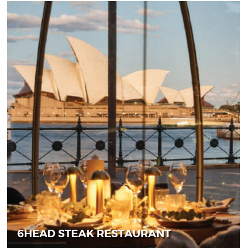
6HEAD STEAK RESTAURANT

Begin your day with an onsite Vineyard Inspection followed by The Hunter Wine Theatre experience. Go back in time and learn about the Hunter's wine heritage, Australia's oldest region. Learn how grapevines are maintained, see the annual grape harvest, the grape crusher in action and the actual wine making process with a visual presentation and wine tutorial with the Cellar master. Next, explore the self-guided Hunter Farm Tour at your own pace. Collect a map and a bucket of animal food. At the Adventure Centre Shed to get up close and personal with our friendly barnyard crew, featuring sheep, goats, cows, donkeys, mules, pigs, ponies, bulls, alpacas, and more! Subsequently, gather for a delightful experience of barrel-rolling fun, immersing yourself in the heart of wine country while indulging in this unique and exhilarating activity. Spend the rest of your day at