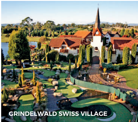
GRINDELWALD SWISS VILLAGE