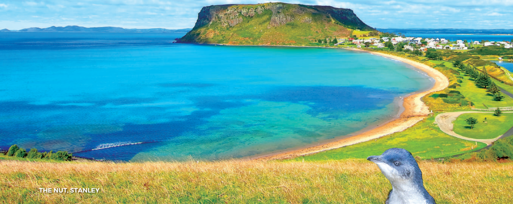
THE NUT, STANLEY