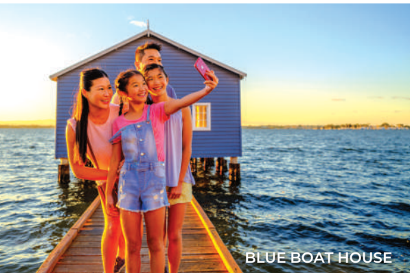
BLUE BOAT HOUSE