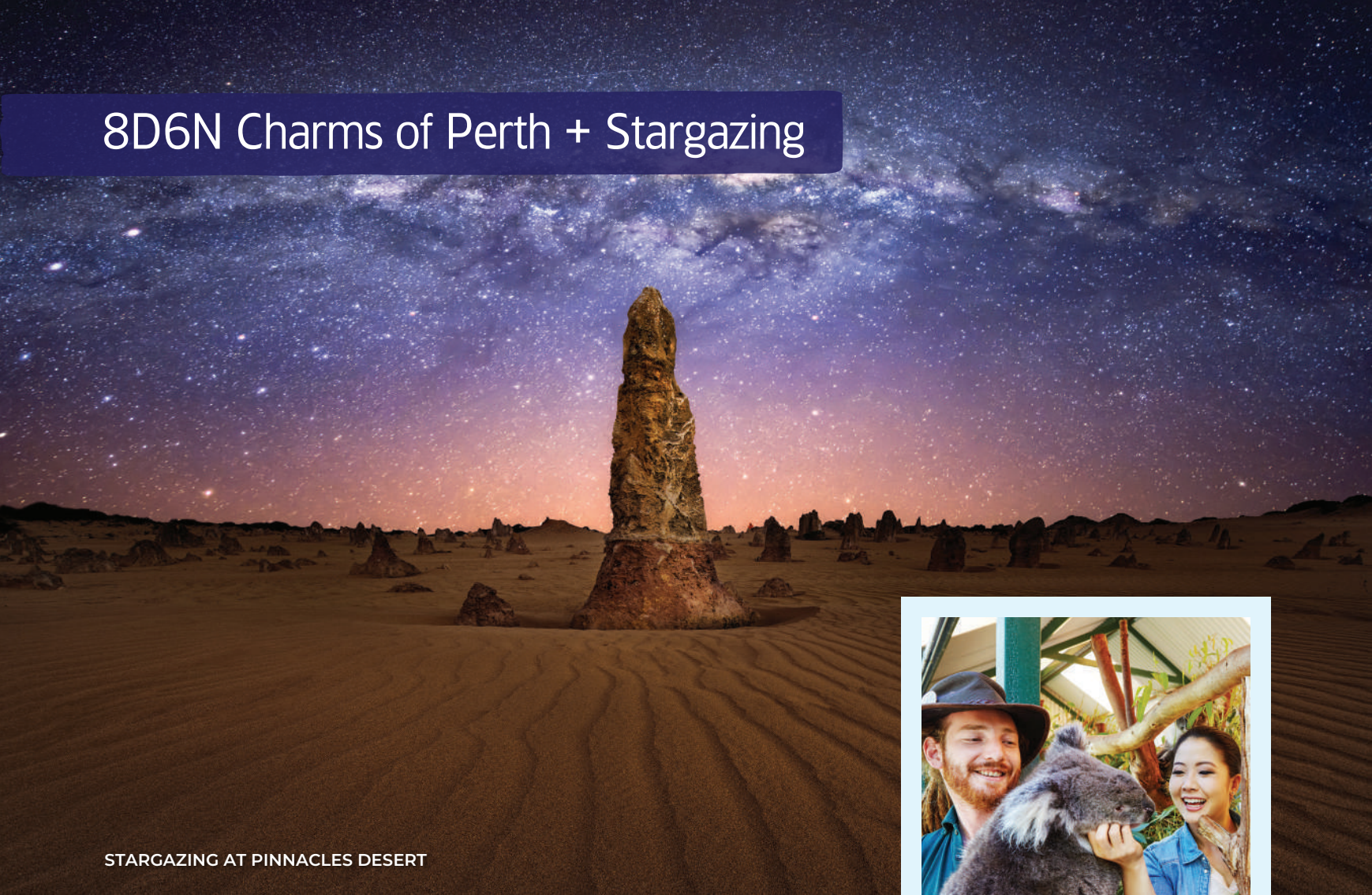
STARGAZING AT PINNACLES DESERT