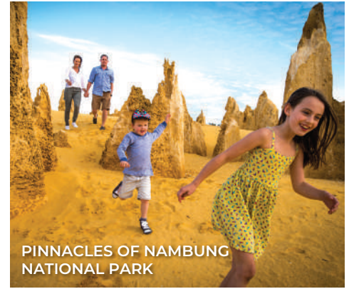
PINNACLES OF NAMBUNG NATIONAL PARK

Note: Truffle Hunting is only available on Saturdays, Sundays and during the seasonal period between Jun to Aug. In the event Truffle Hunting is unavailable, it will replace by Nocturnal Animal Tour, where you can view a variety of animals including kangaroos, possums, bandicoots, and woylies, and even get the chance to see night birds such as owls and tawny frogmouths.