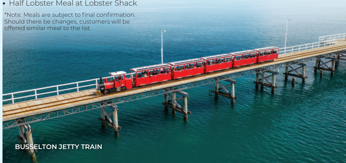
BUSSELTON JETTY TRAIN

*Note: Hotel subject to final confirmation. Should there be changes, customers will be offered similar accommodation to the list.