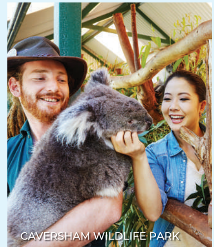
CAVERSHAM WILDLIFE PARK

Breakfast, Meals on Board We hope you enjoyed your vacation with our company, and we look forward to seeing you again on your next trip.