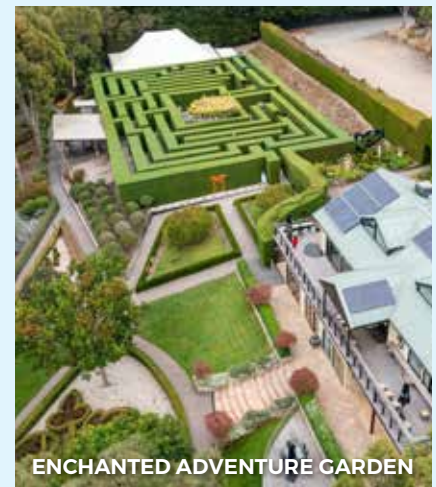
ENCHANTED ADVENTURE GARDEN

Note: Breakfast box will be provided for early departure.