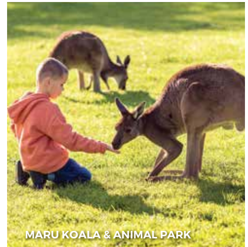
MARU KOALA & ANIMAL PARK