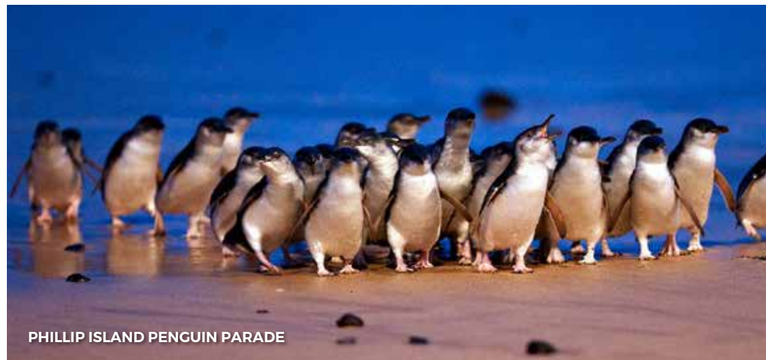
PHILLIP ISLAND PENGUIN PARADE