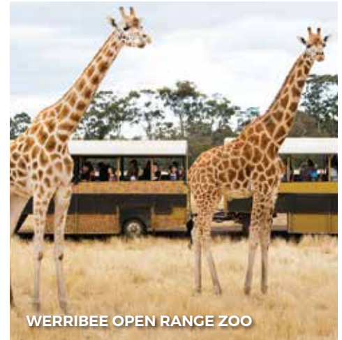
WERRIBEE OPEN RANGE ZOO

Today, begin your unforgettable journey with a scenic Searoad Ferry ride across the stunning waters of Port Phillip from Queenscliff Harbour to Sorrento onboard a world-class car and passenger ferry. Thereafter, board the state-of-the-art gondola Arthurs Seat Eagle (one-way) and soar over the verdant treetops to the highest point of beautiful Mornington Peninsula for abundant views that will take your breath away! Make your way to Enchanted Adventure Garden which provides a variety of activities and attractions suitable for all ages. Whether you're seeking adventure, relaxation, or family-friendly fun, there's something for everyone to enjoy in this enchanting destination. In the evening, head over to Penguin Reserve to watch the popular Penguin Parade . Behold the arresting sight of waddling penguins as they return to shore after feeding at sea.