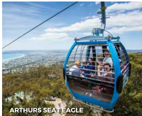
ARTHURS SEAT EAGLE