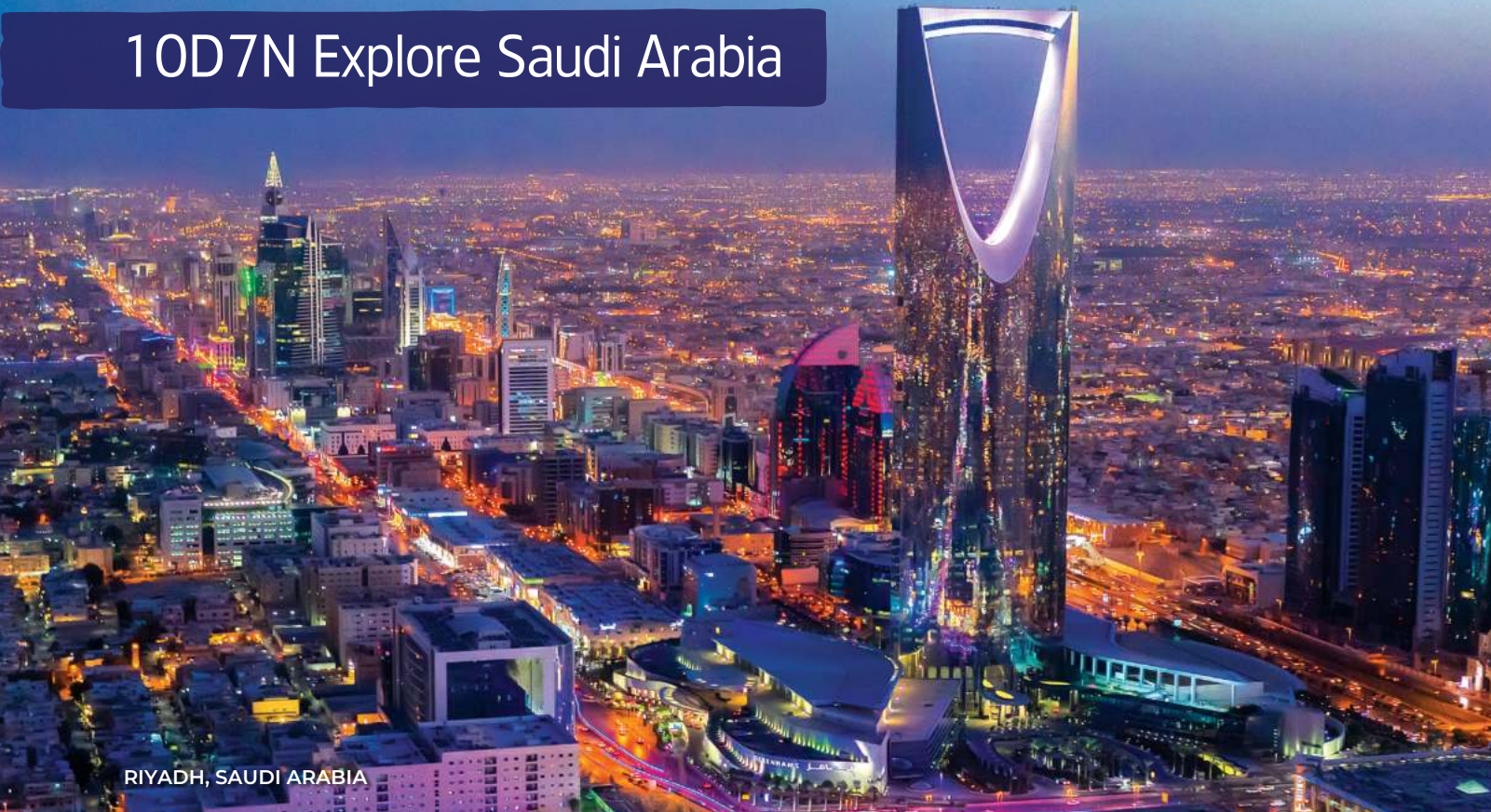
RIYADH, SAUDI ARABIA