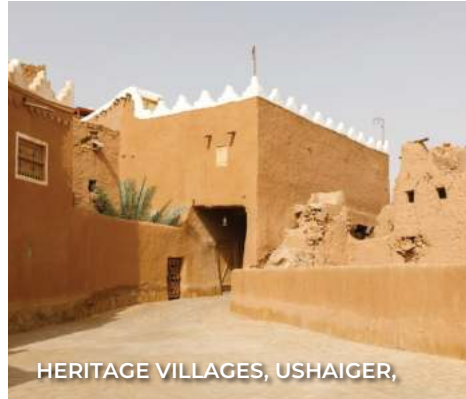
HERITAGE VILLAGES, USHAIGER,

sweeping elegantly down the mountainside, as do ancient zig-zagging camel trails and passing through the old pedestrian road towards the tourist village of Alkar at the bottom of the mountain. Taif's central market is a labyrinth of narrow alleys, which snake through sand-coloured buildings to peaceful plazas. Laid out in themed areas, explore sections devoted to rich local honey, perfume, Islamic clothing, and jewellery. Head back to Jeddah for dinner in the hotel.