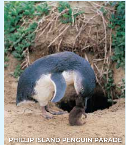
PHILLIP ISLAND PENGUIN PARADE

Spend the morning at your leisure before boarding your homebound flight. We hope you enjoyed your vacation with our company and we look forward to seeing you again on your next trip.