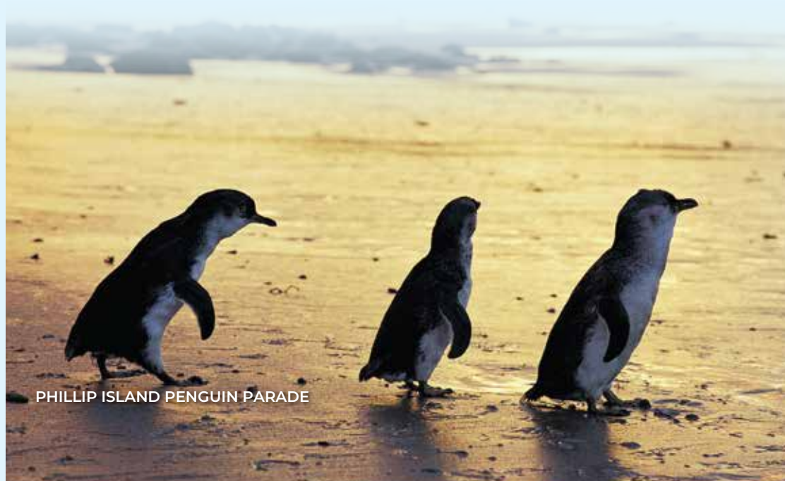
PHILLIP ISLAND PENGUIN PARADE

*Note: Hotels subject to final confirmation. Should there be changes, customers will be offered similar accommodations as stated in this list.