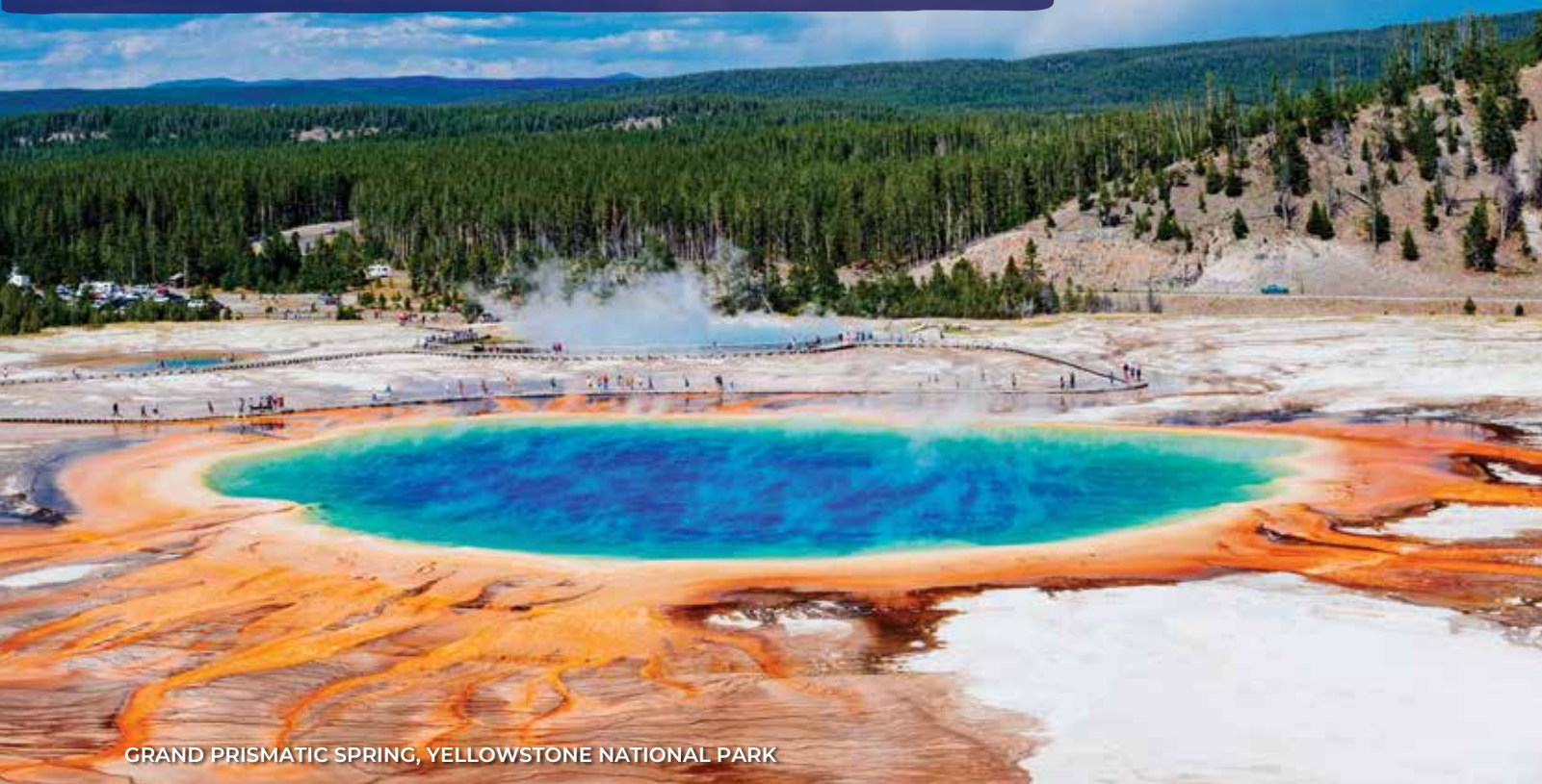
GRAND PRISMATIC SPRING, YELLOWSTONE NATIONAL PARK