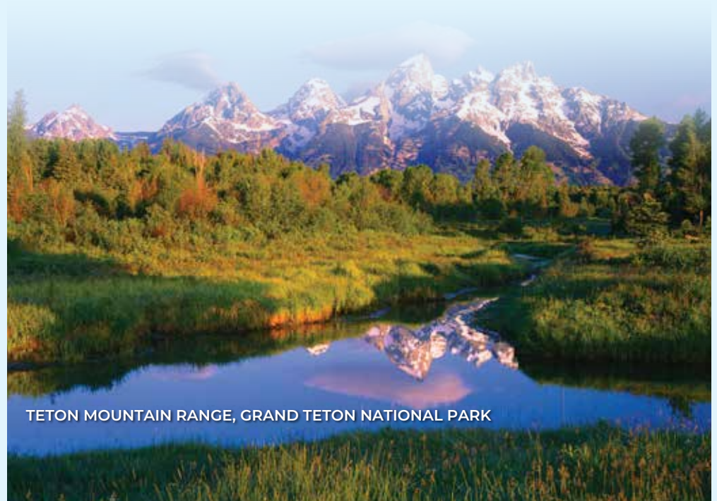
TETON MOUNTAIN RANGE, GRAND TETON NATIONAL PARK

*Note: Hotels subject to final confirmation. Should there be changes, customers will be offered accommodation similar to this list.