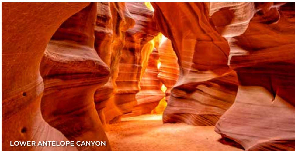
LOWER ANTELOPE CANYON

Breakfast, Dinner Head for Yellowstone National Park , the world's first national park and home to one of the world's largest calderas with over ten thousand thermal features, and more than 300 geysers and 290 waterfalls. First stop, Artist Point , the viewpoint of Lower Falls which flows 308 feet down to the Yellowstone River. Next stop will be the Norris Geyser Basin . One of the largest thermal basins and most active hydrothermal area in Yellowstone National Park. It is also one of the most volatile. Mammoth Hot Springs are a must-see feature in Yellowstone National Park because it is so different from other thermal area as the limestone is a relatively soft type of rock which allows the travertine formations to grow much