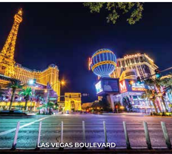
LAS VEGAS BOULEVARD

faster than other sinter formations. It has been described as looking like a cave turned inside out.