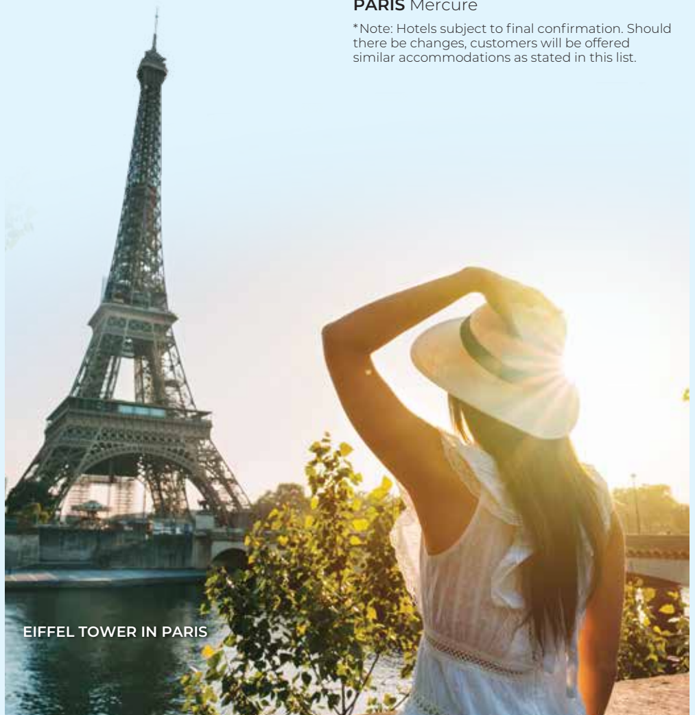
EIFFEL TOWER IN PARIS

*Note: Hotels subject to final confirmation. Should there be changes, customers will be offered similar accommodations as stated in this list.