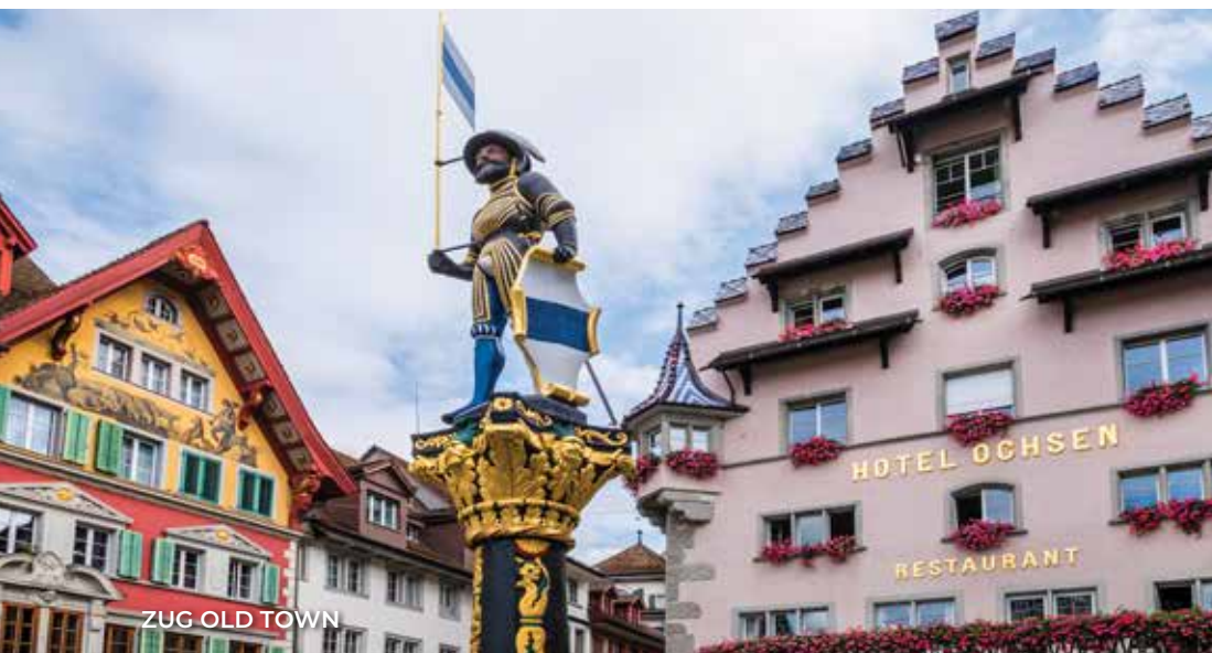
ZUG OLD TOWN

department store in Paris for some souvenir shopping. You may also wish to join an optional scenic Seine River cruise. Optional: Seine River Cruise