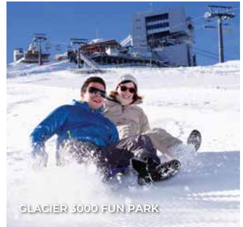
GLACIER 3000 FUN PARK

Wander through the picture-perfect Burgundy wine region and stop in its walled regional capital Beaune . Start a guided tour of the UNESCO World Heritage Hospices de Beaune , formerly a hospital founded in 1443 that is now the Hôtel-Dieu Museum, well-known for its turrets, colourful roof tiles, and pretty courtyards—as well as the annual wine auction it hosts. This tour will take you on a blast to the past as you explore the kitchens and other rooms full of enchanting artifacts and tapestries! The tour will round off with a visit to a famous Burgundy vineyard , where you'll sample a variety of Burgundy wines and learn about French wine-making.