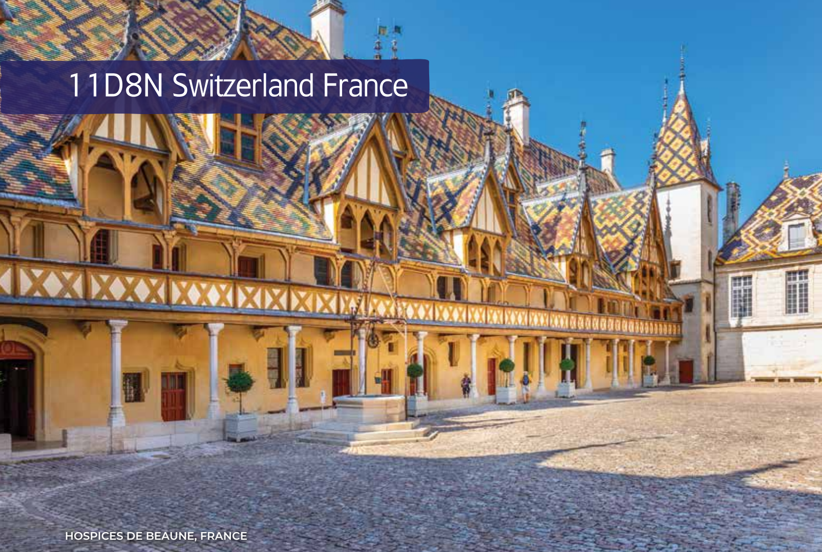
HOSPICES DE BEAUNE, FRANCE