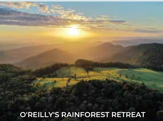
O'REILLY'S RAINFOREST RETREAT

*Note: Hotel subject to final confirmation. Should there be changes, customers will be offered similar accommodation to the list.