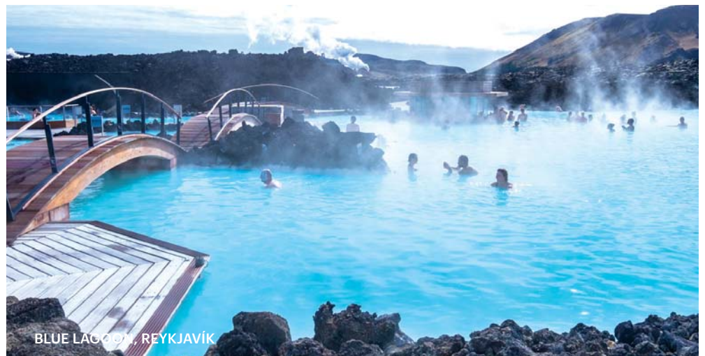
BLUE LAGOON, REYKJAVIK

Today, depart for the must visit place in Iceland, the Jökulsárlón Glacier Lagoon . The glacial lagoon is one of Iceland's greatest wonders of nature. Iceland's famous glacial lagoon filled with floating icebergs. Visiting the lagoon is breathtaking experience, you will have feeling like entering a magical world and you may even be lucky enough to see some seals. Today,