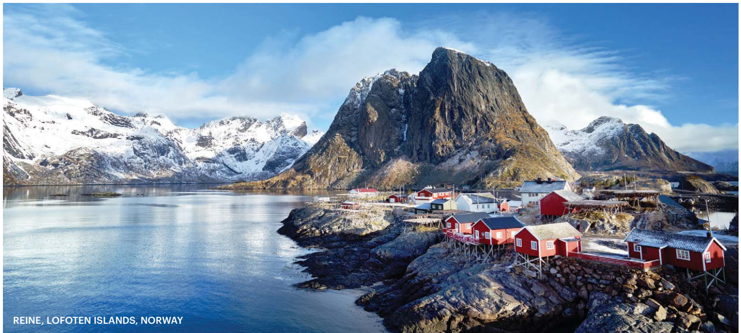
REINE, LOFOTEN ISLANDS, NORWAY

that remains deeply entwined with the reindeer. Reaching Harstad tonight, you can choose to go for an optional experience to the Aurora Summit Lodge, set on the top, 535 meters above sea level and be transported to the summit by Snowmobiles and sleds with a view of the aurora in luck.