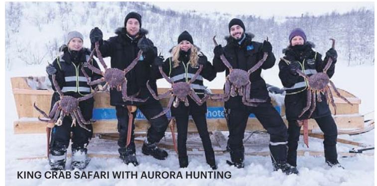
KING CRAB SAFARI WITH AURORA HUNTING