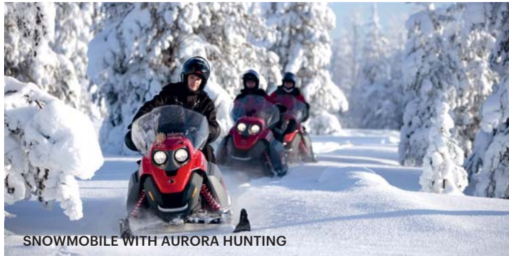
SNOWMOBILE WITH AURORA HUNTING