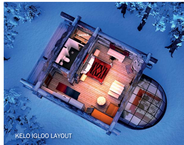
KELO IGLOO LAYOUT

Spend a night in Finland's Finest Resort: