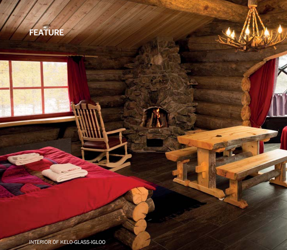
INTERIOR OF KELO-GLASS-IGLOO