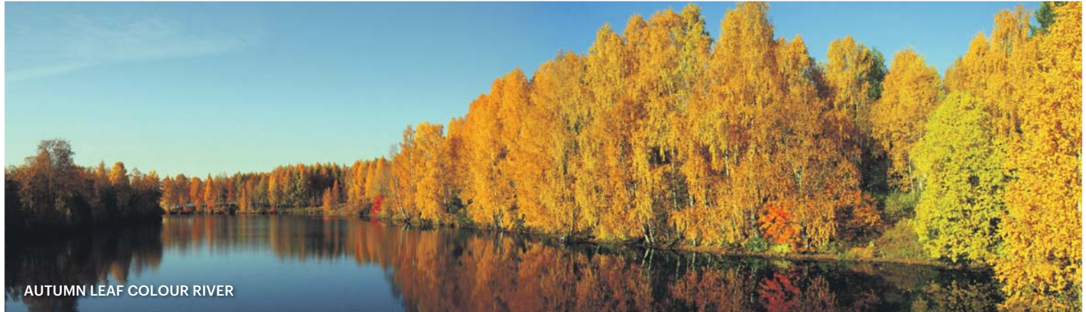
AUTUMN LEAF COLOUR RIVER