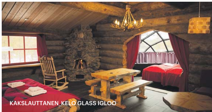
KAKSLAUTTANEN KELO GLASS IGLOO