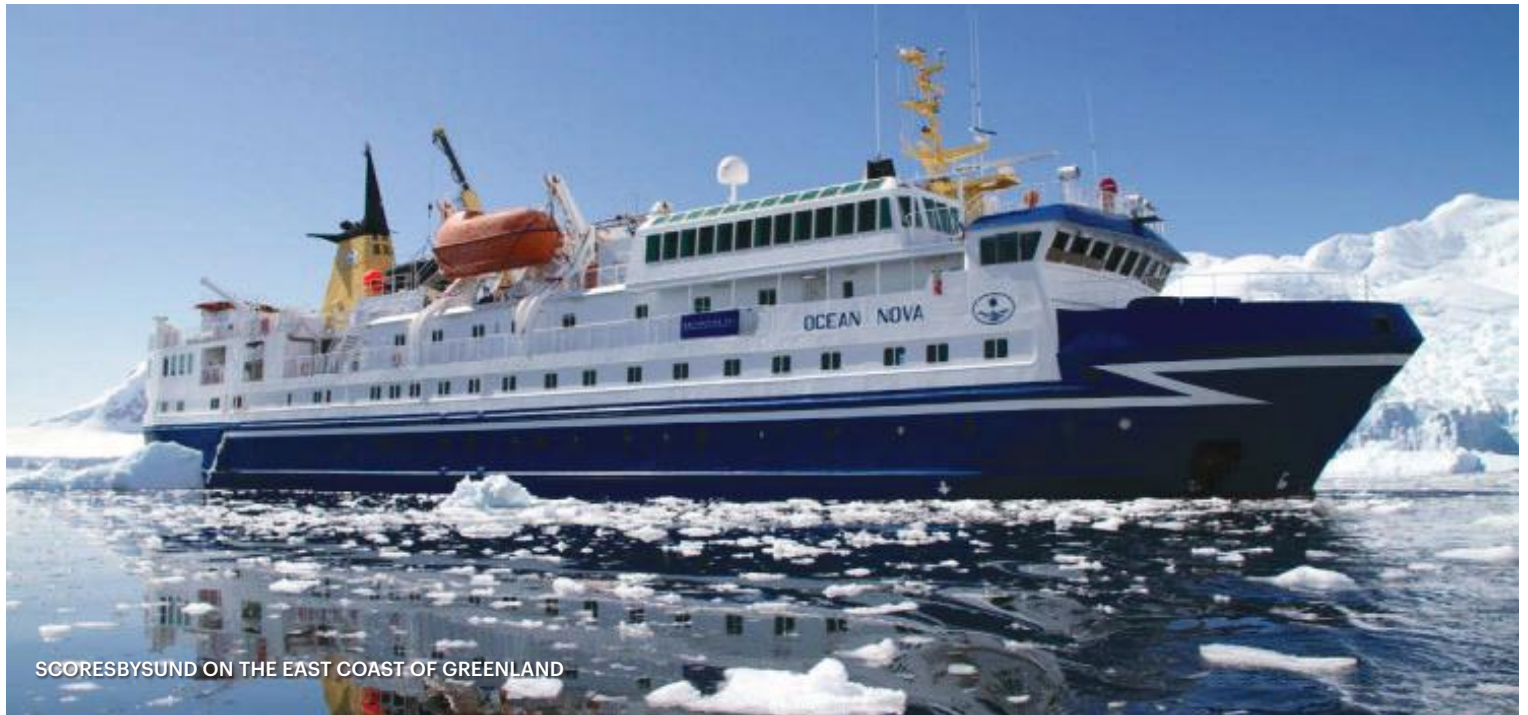
SCORESBYSUND ON THE EAST COAST OF GREENLAND