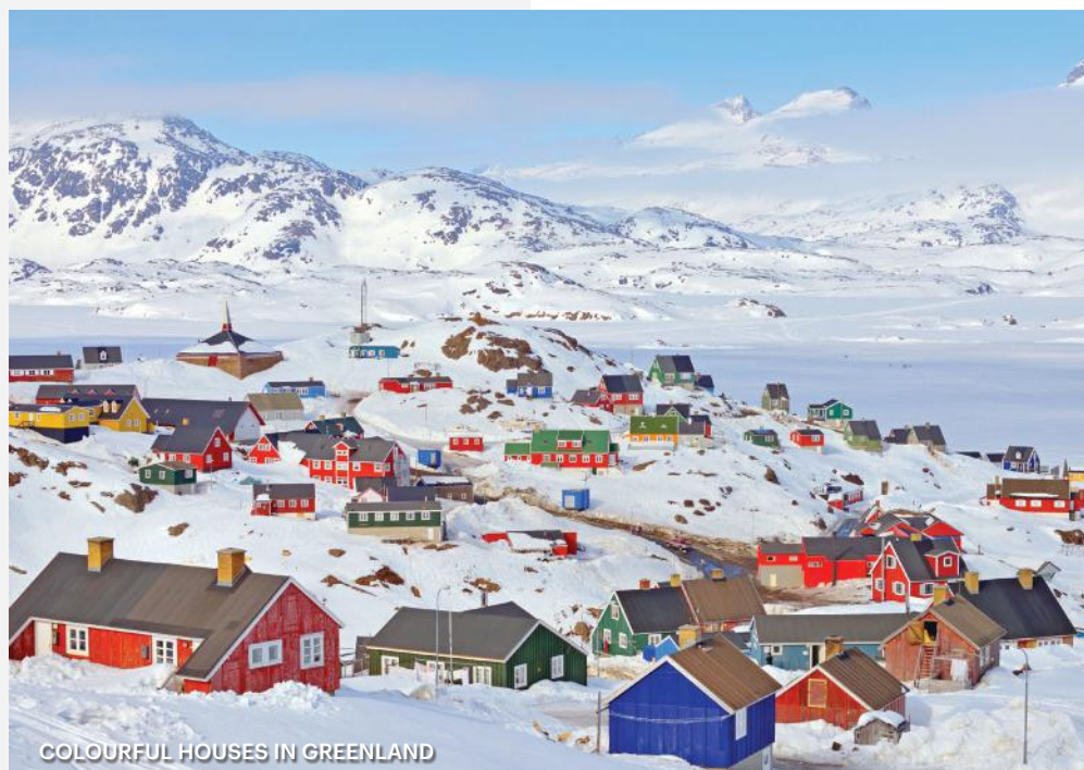
COLOURFUL HOUSES IN GREENLAND