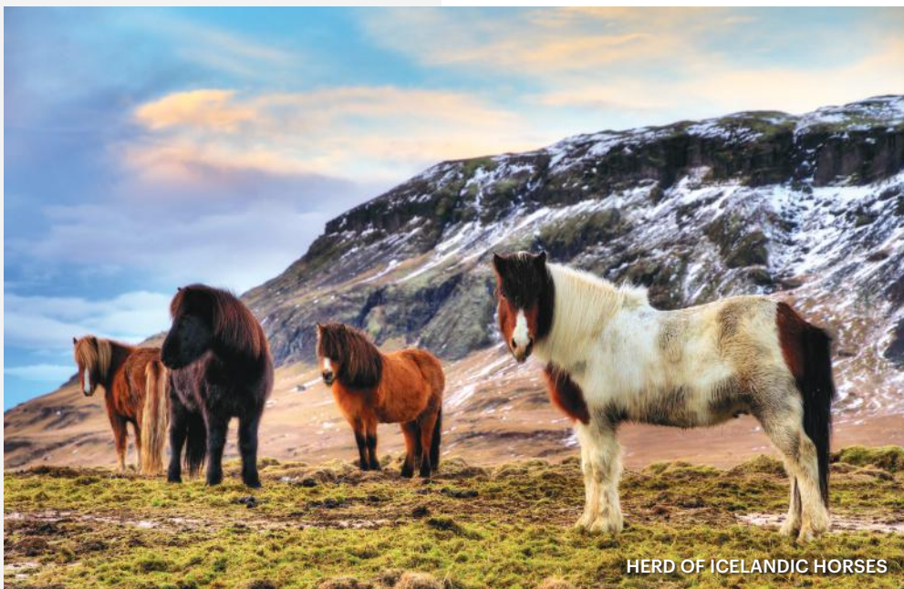
HERD OF ICELANDIC HORSES

Enjoy a free day at leisure, shopping, sightseeing and exploring the city. You could also join an optional tour that departs from Reykjavik, to the Langjökull glacier, Iceland's second largest glacier. Onboard a monster truck, for a once in a lifetime adventure deep inside one of the world's largest man made ice caverns. The caverns are composed of an extensive system of tunnels and chambers that stretch close to 300 metres into the solid ice cap towards a breath taking natural ice cave at the heart of the glacier.