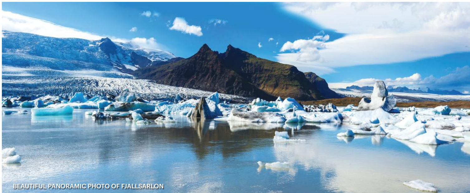
BEAUTIFUL PANORAMIC PHOTO OF FJALLSARLON