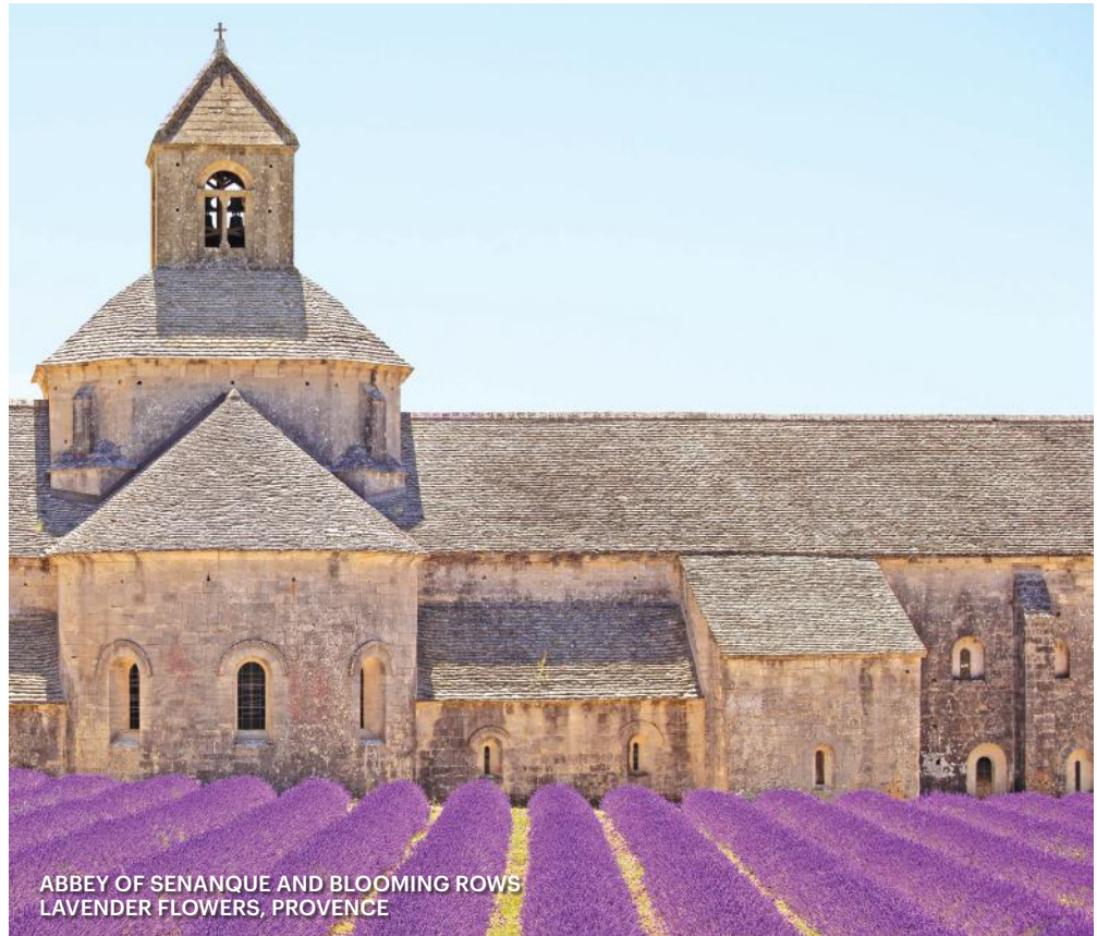
ABBEY OF SENANQUE AND BLOOMING ROWS LAVENDER FLOWERS, PROVENCE

Travel south for your long awaited Paris adventure. First, set out on a guided tour of the city – take in the sights of Champs-Élysées, Place de la Concorde, Louvre