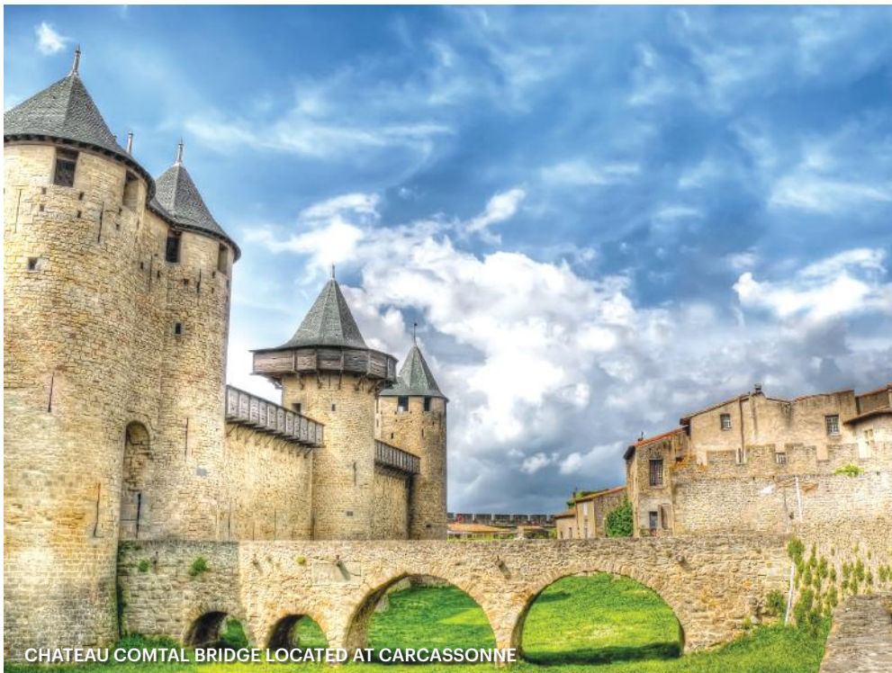
CHATEAU COMTAL BRIDGE LOCATED AT CARCASSONNE