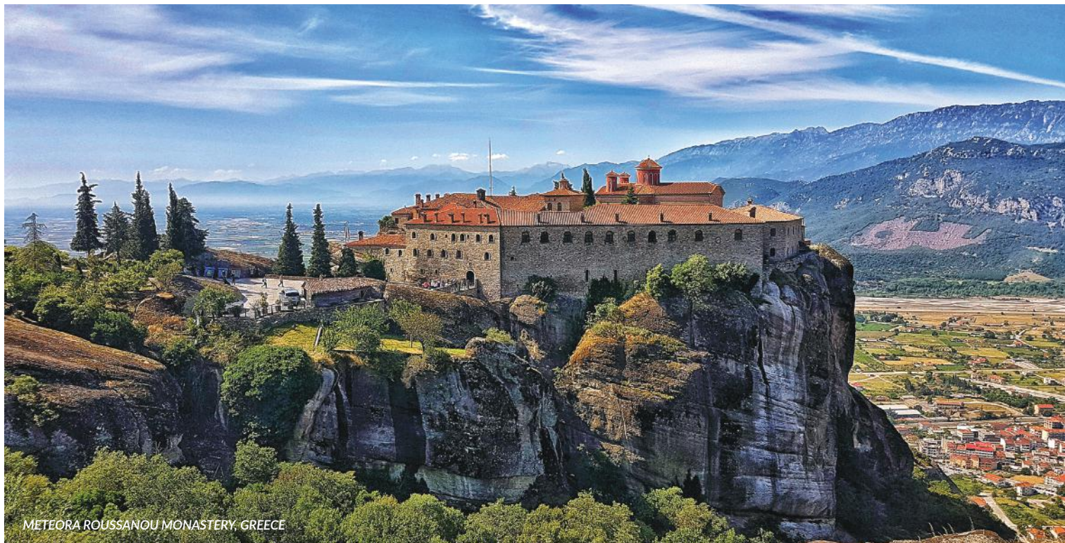
METEORA ROUSSANOU MONASTERY, GREECE