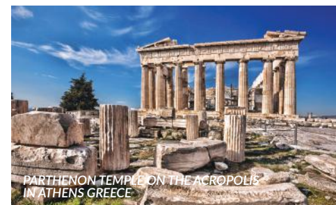
PARTHENON TEMPLE ON THE ACROPOLIS IN ATHENS GREECE