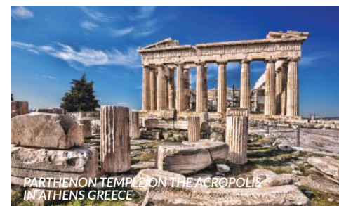
PARTHENON TEMPLE ON THE ACROPOLIS IN ATHENS GREECE