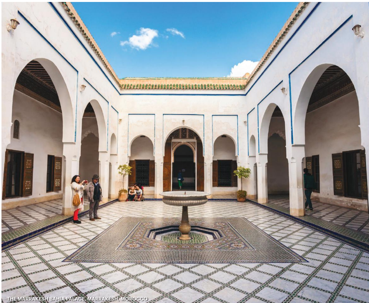
THE MARRAKESH BAHIA PALACE, MARRAKESH, MOROCCO

entire fortified villages. If the old Kasbahs seduce with their evocation power, the scenery touch with their contrasts, luminosity and silence. This is one of the most appealing and demanded routes in Morocco. Finally arrive at Ouarzazate