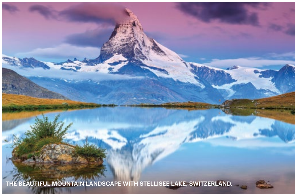
THE BEAUTIFUL MOUNTAIN LANDSCAPE WITH STELLISEE LAKE, SWITZERLAND.

of the most photographed mountains in the world. You will spend the night in Zermatt.