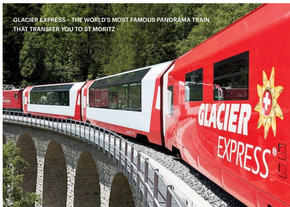
GLACIER EXPRESS – THE WORLD'S MOST FAMOUS PANORAMA TRAIN THAT TRANSFER YOU TO ST MORITZ