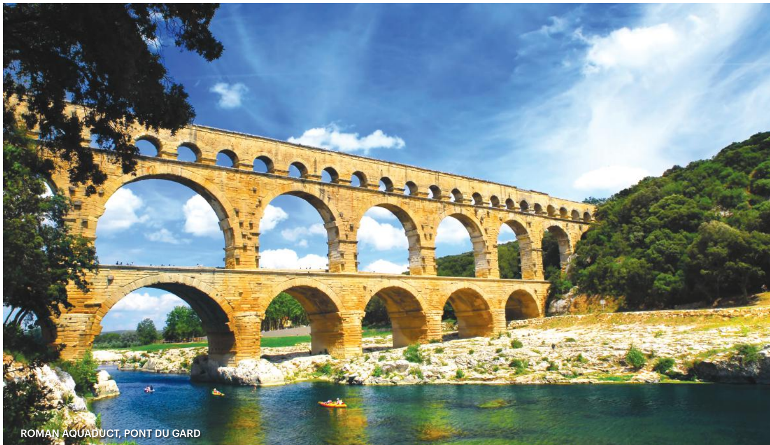
ROMAN AQUADUCT, PONT DU GARD

Thereafter, we shall visit a special city – Avignon , whose historic centre has been crowned a UNESCO World Heritage site. A professional guide will bring you on a tour of Avignon, which covers the Palais des Papes , the cathedral and the Pont d'Avignon . During the tour you will enter the Palais des Papes, one of the largest and most important medieval Gothic buildings in Europe. Before the end of day, you may wish to take up an optional tour to Provence Factory Outlet to do some shopping. Note: The lavender field tour is only available during the lavender period (approximately mid-June to August).