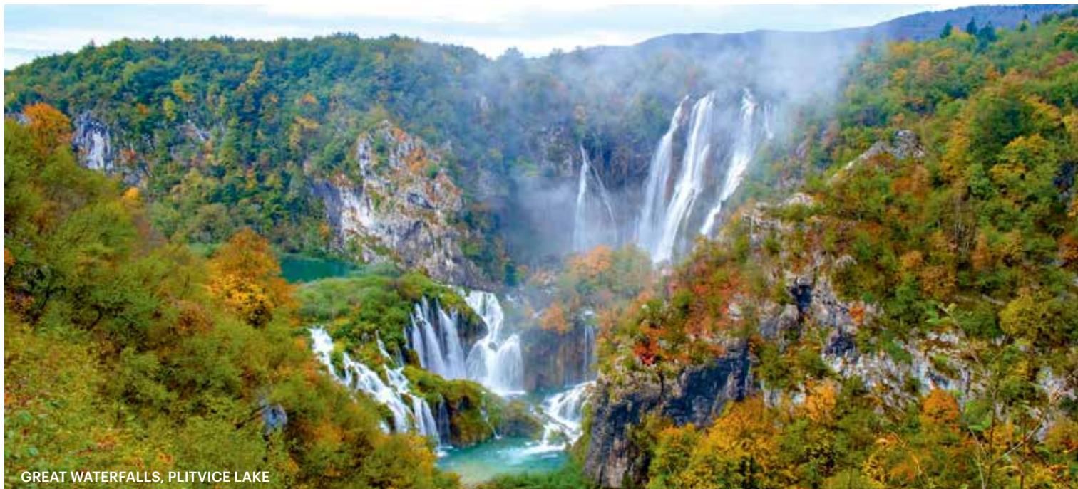
GREAT WATERFALLS, PLITVICE LAKE

including the remains of the original palace, and the Peristil Square . Then continue on to Zadar , a city built in the centre of the Croatian Adriatic with three thousand years of tumultuous history. Embark on a guided promenade about the city and visit the Western Quay for an up-close look at the Sea Organ and the Monument to the Sun , follow by St. Donatus Church , the Roman Forum , St. Anastasia's Cathedral , St. Mary's Church and the Lion's Gate .