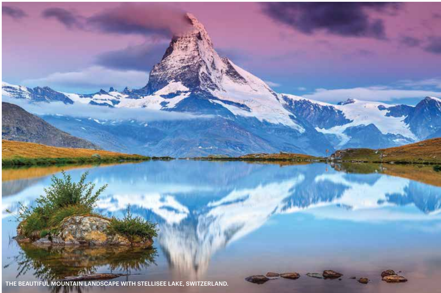
THE BEAUTIFUL MOUNTAIN LANDSCAPE WITH STELLISEE LAKE, SWITZERLAND.