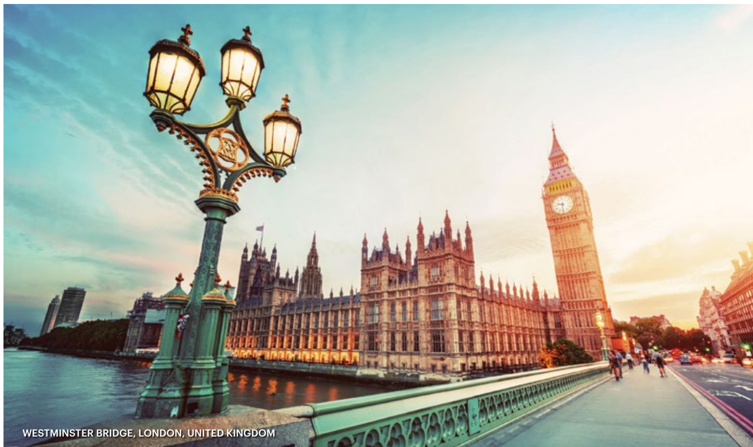
WESTMINSTER BRIDGE, LONDON, UNITED KINGDOM