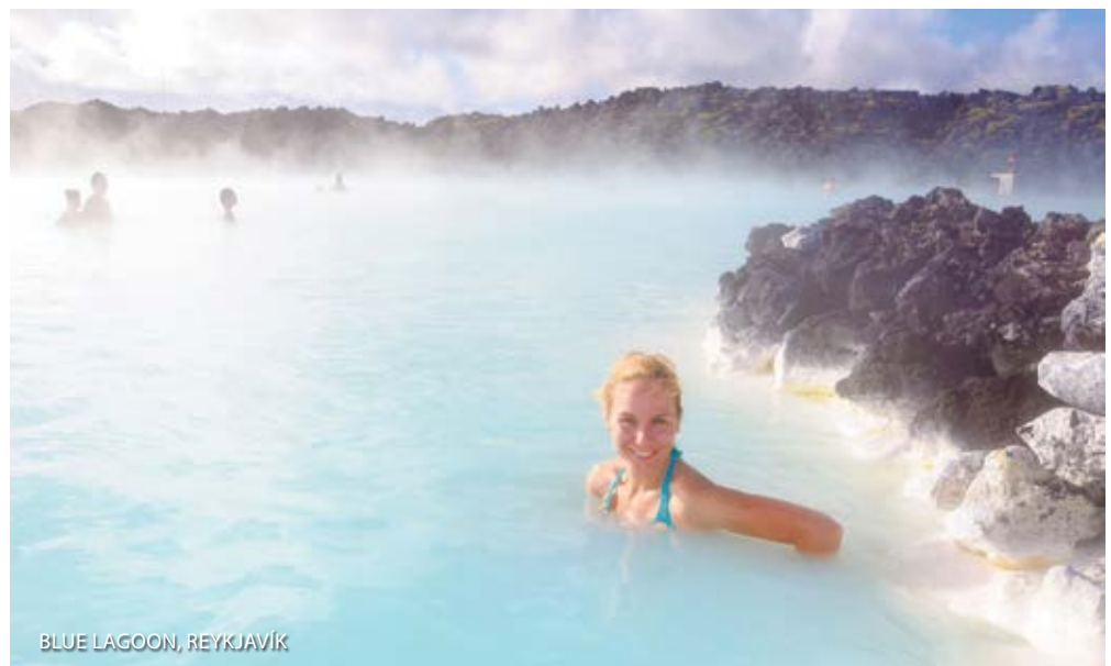
BLUE LAGOON, REYKJAVÍK