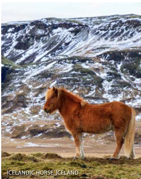
ICELANDIC HORSE, ICELAND

Board a domestic flight to Copenhagen . Upon arrival transfer back to hotel. Enjoy the rest of the day at leisure.