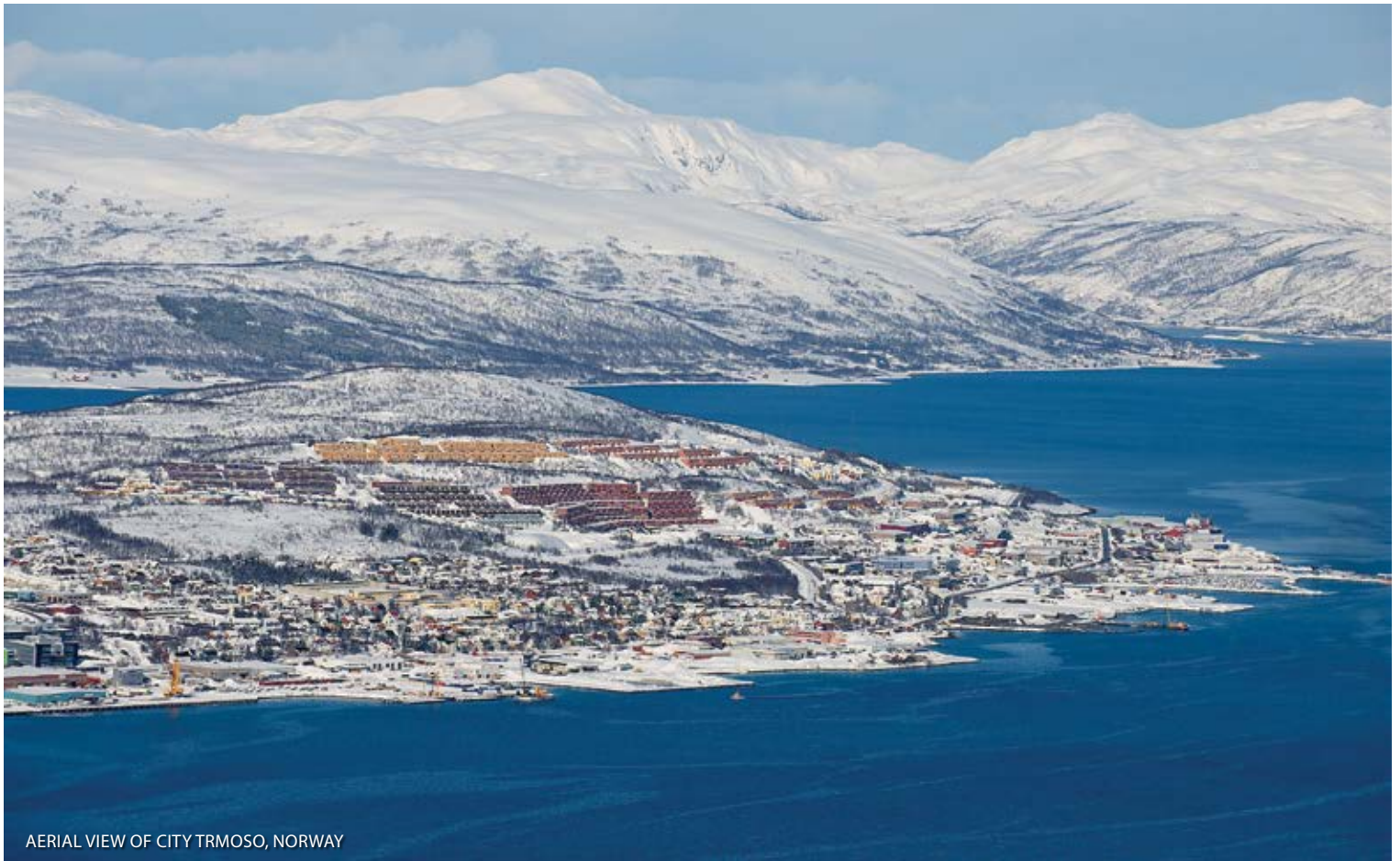
AERIAL VIEW OF CITY TRMOSO, NORWAY