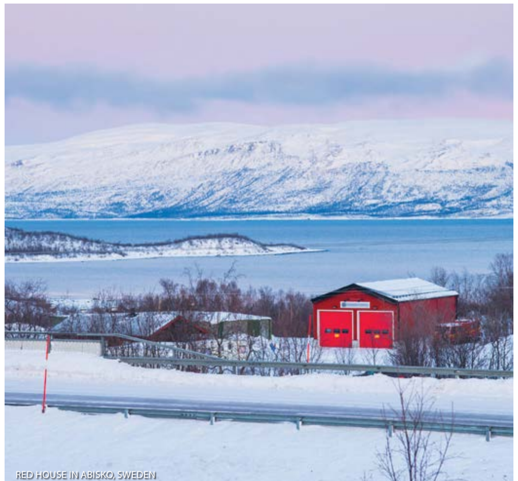
RED HOUSE IN ABISKO, SWEDEN