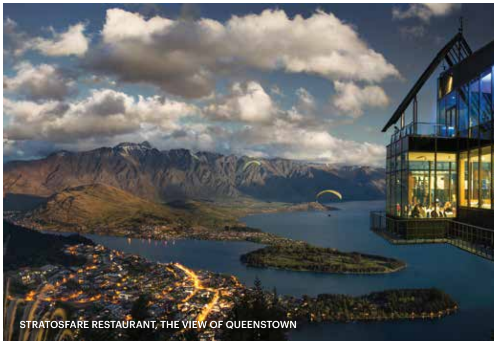
STRATOSFARE RESTAURANT, THE VIEW OF QUEENSTOWN