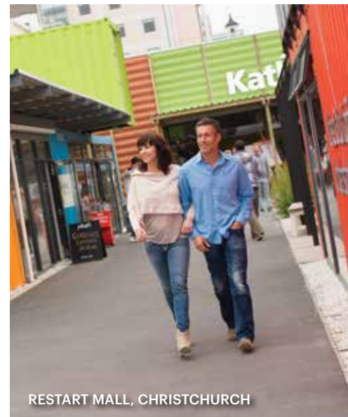
RESTART MALL, CHRISTCHURCH