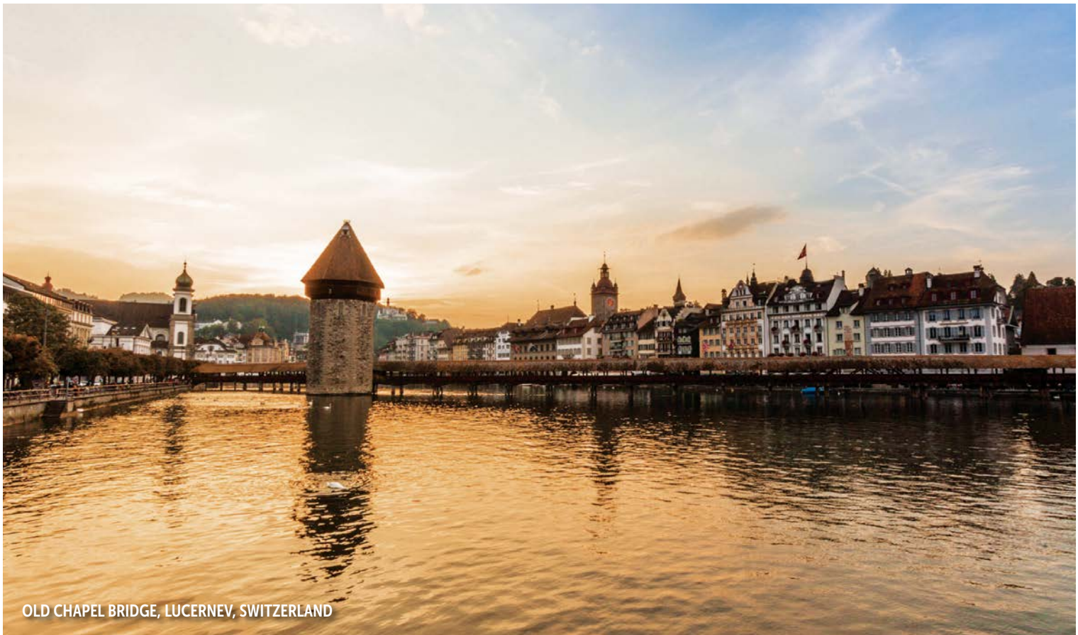
OLD CHAPEL BRIDGE, LUCERNEV, SWITZERLAND