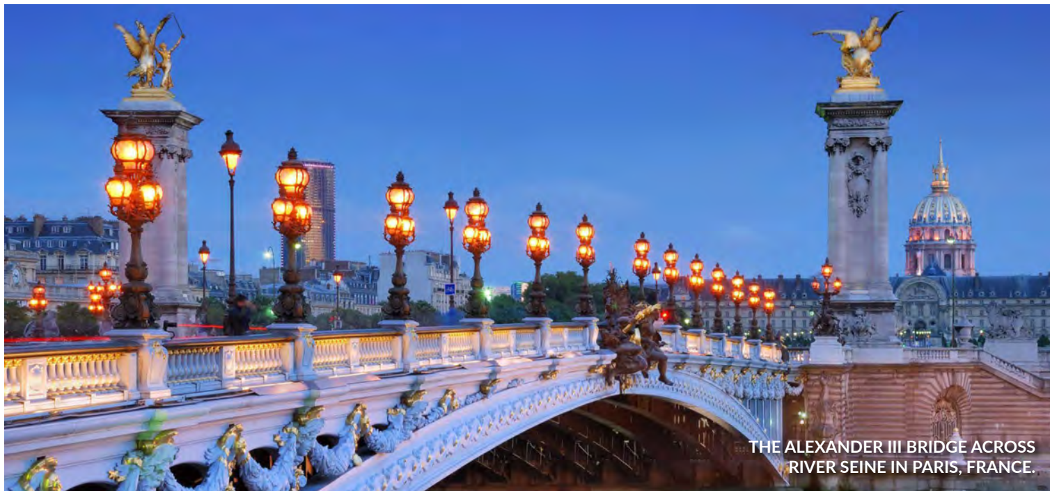
THE ALEXANDER III BRIDGE ACROSS RIVER SEINE IN PARIS, FRANCE.