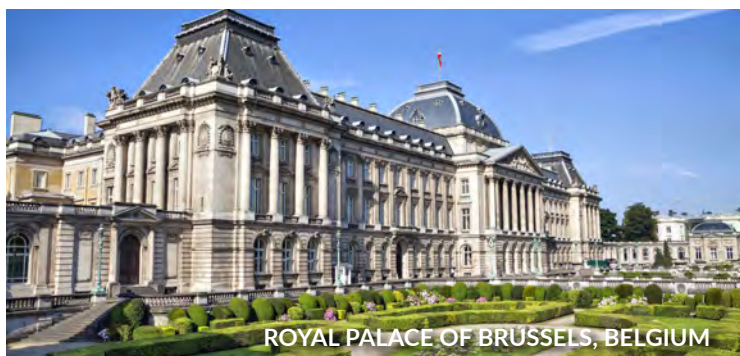
ROYAL PALACE OF BRUSSELS, BELGIUM