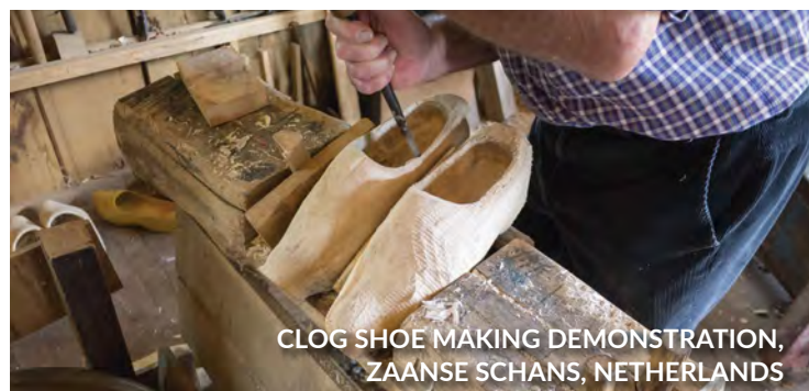
CLOG SHOE MAKING DEMONSTRATION, ZAAANSE SCHANS, NETHERLANDS

the past with a futuristic edge. Drive by the picturesque Royal Palace of Laeken before arriving in the city to see the Royal Palace of Brussels . Next, take a leisure jaunt through the La Grand-Place , a market square featuring architecture of an eclectic blend of Western artistic styles, which would lead you to the renowned Manneken Pis , a small sculpture depicting a naked boy urinating into a water fountain that represents the rebellious spirit of the city of Brussels. Thereafter, spend the rest of the afternoon for some shopping at leisure, but do not forget to pick up some Belgian chocolate as a sinful treat to reward yourself. You may also wish to make an optional visit to nearby city Bruges before you end the day. Optional: Bruges Tour