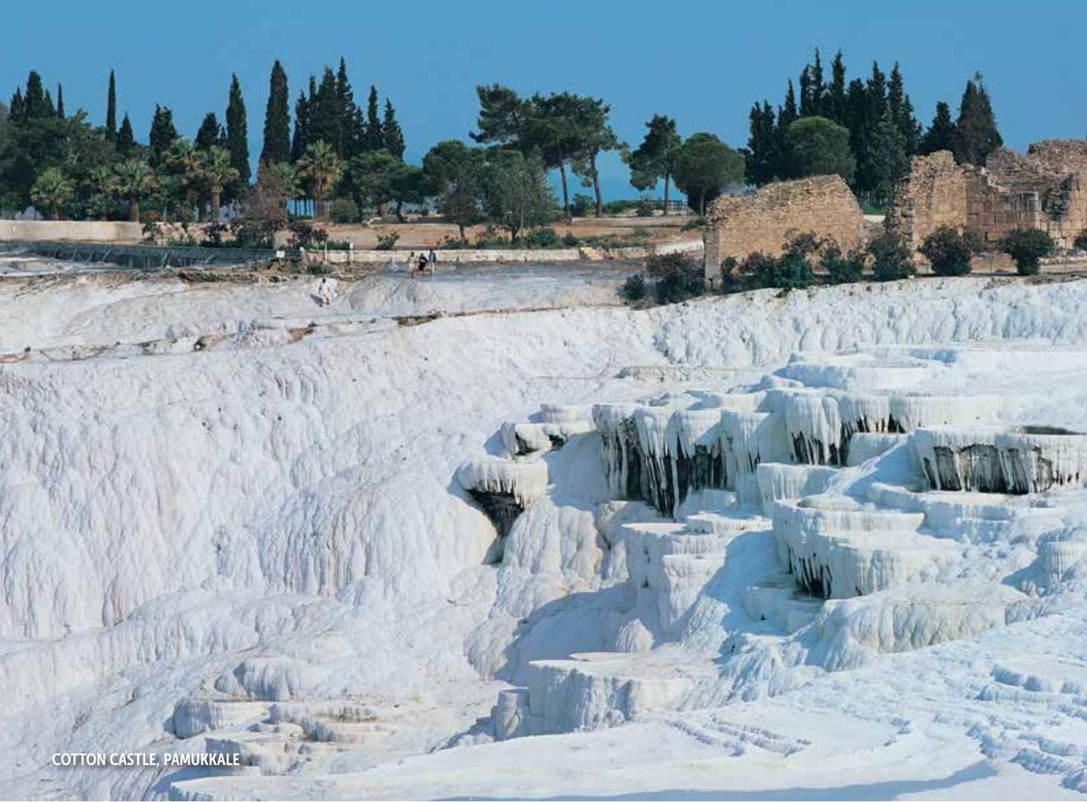
COTTON CASTLE, PAMUKKALE

Enter the Hierapolis to experience its unrivalled thermal baths, before stepping into the Cotton Castle . Formed by deposits of white limestone from thermal springs, the heavenly terraces exude a surreal, mystical vibe not to be missed. Lunch at Horozluhan, an ancient caravanserai restored restaurant. Visit the 700-year-old ancient "hotel", known as the Caravanserai , which used to host traders and travellers. Then, visit the museum of 13th century philosopher, Melvana Celaleddin-i Rumi , for the last stop of the day.