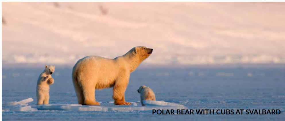
POLAR BEAR WITH CUBS AT SVALBARD

Note: the appearance of the Northern Lights cannot be guaranteed as it is a naturally occurring phenomenon and is subject to weather conditions.